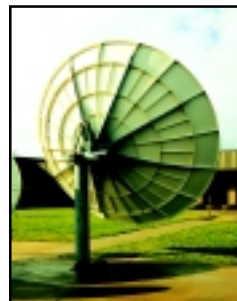
Back View Series 1254

Prodelin Corporation is the world's largest manufacturer of Rx/Tx VSAT antennas. We have the broadest product line in the industry including Receive Only, Rx/Tx and Rural Telephony antenna systems. Prodelin offers nineteen antenna sizes, 47cm to 4.5M. Prodelin is the leader in obtaining type certifications and approvals for Intelsat, AsiaSat and Eutelsat. Prodelin antennas provide the best quality in the market due to the sophisticated, precision SMC compression molding process technology. Prodelin provides the best value antenna solution to the market with competitive prices, the highest quality products and superb engineering support. Prodelin is ISO registered, KEMA # 70022.01. Prodelin - The Market Leader in VSAT Antennas.